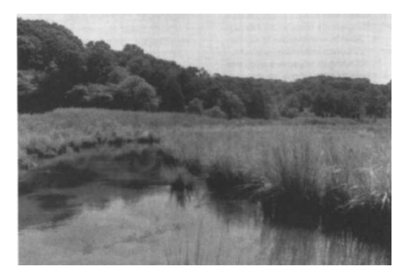
Figure 2 - View of Sullivan Cove from Severn River beach at intertidal marsh. Note Atlantic white-cedar at intertidal fresh fracture at base of hillside slope and Dramatic change to tidal marsh.

Carrollton Manor and Lakeland both contain tidal freshes and ponds with Atlantic white-cedar borders. Carrollton Manor has a large number of seedlings in comparison to Lakeland, a difference which we attribute to the effect of beavers browsing woody vegetation and lightly disturbing soils on the pond borders. Removal of plant competition by beavers may provide increased light for germination, or there may be an ancillary beneficial effect from soil