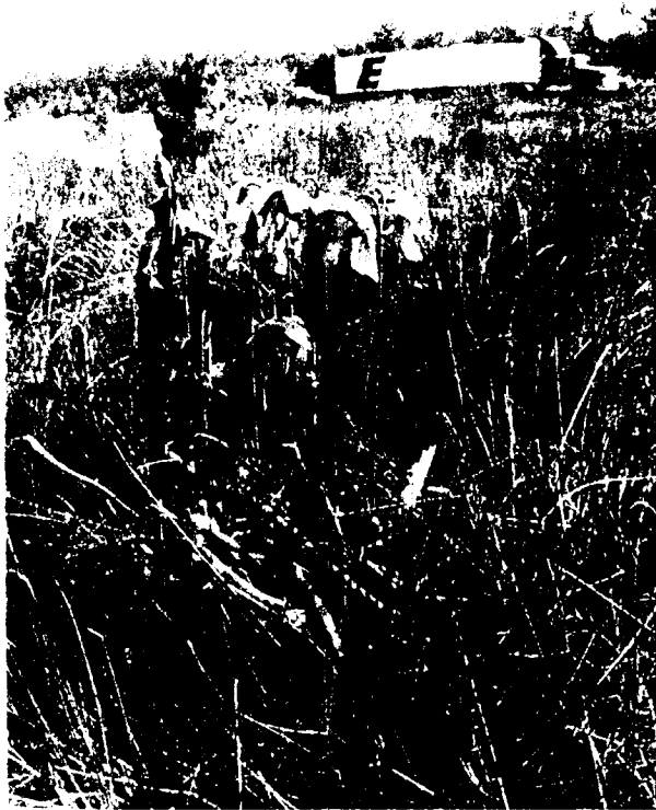
Fig. 1. Yellow pitcher plant, Sarracenia flava L., in bloom during their third successful year at Fort Lee wetland mitigation site.

A total of 1126 yellow pitcher plant have been introduced on VDOT rights-of-way with survival averaging 66% (Fig. 1, Table 1). Somewhat surprisingly, the July pitcher plant introduction at Fort Lee had the highest survival rate. However, this must be tempered